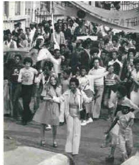
Above: In the early years, the enthusiasm for the event was evident in the streets. Below: One of the many stationary sound systems that came to dominate the Notting Hill experience for so many.