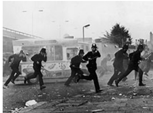
Above: the Notting Hill Riots in 1976.