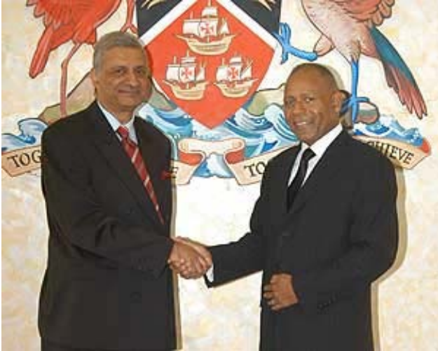
Above: The Honourable Patrick Manning, Prime Minister of the Republic of Trinidad and Tobago with Kamallesh Sharma, Commonwealth Secretary-General.

“CHOGM is a spectacular national event. It leaves behind a legacy of skills and infrastructure, and belief.” – Kamallesh Sharma