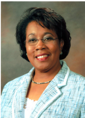
Senator the Honourable Hazel Manning, Minister of Education

BG Trinidad and Tobago (BGTT) and the Ministry of Education have joined forces to promote literacy among the primary school population.