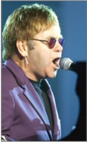
File photo: Elton John

The 2007 Plymouth Jazz Festival kicks off on April 27 th and will run for three days in the picturesque fishing village of Plymouth, Tobago.