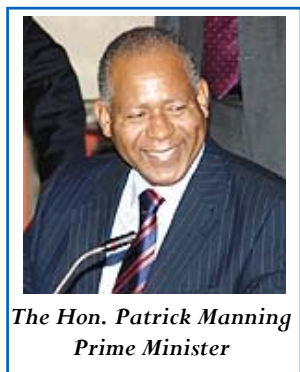
The Hon. Patrick Manning Prime Minister

The AU's commitment to securing Africa's democracy, human rights and sustainable economic development, is of the utmost importance to Africa's future. Your efforts in the AU are not unlike those of our regional body, the Caribbean Community and