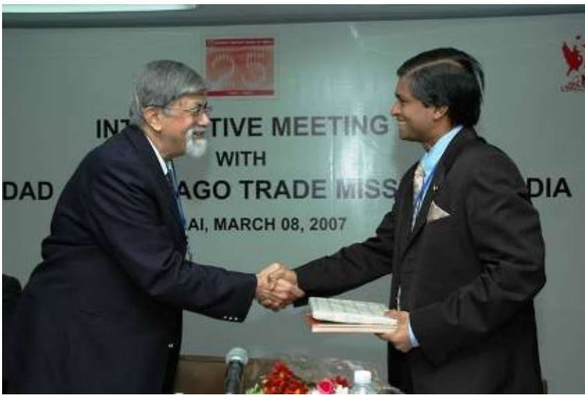
Mr. Rao of India (left), exchanges greetings with Trinidad and Tobago's High Commissioner to India, His Excellency Pundit Maniedeo Persad

Trinidad and Tobago and India are now signatories to a reciprocal Investment Promotion and Protection Agreement (IPPA), which guarantees that investments by businessmen of both nations in each country will be protected under the law, with full access to all profits and guarantees against property seizure, nationalization, etc. The agreement sets the stage for greater levels of investment by Indian businessmen in the local economy.