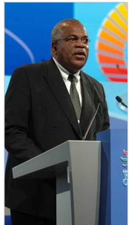
The Hon. Kenneth Valley Minister of Trade and Industry

Minister Valley, in turn, elaborated further on Government's vision of Trinidad and Tobago as a hub for business and trade, and a platform for manufacturing in the Americas, both of which provided ideal opportunities for Indian investors. Minister Valley also requested the support of Minister Nath for the participation of a contingent of Indian businessmen at this year's Trade and Investment Convention in Trinidad and Tobago, scheduled for 16-19 May 2007.