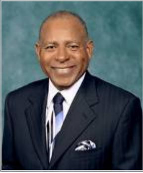
The Honourable Patrick Manning Prime Minister