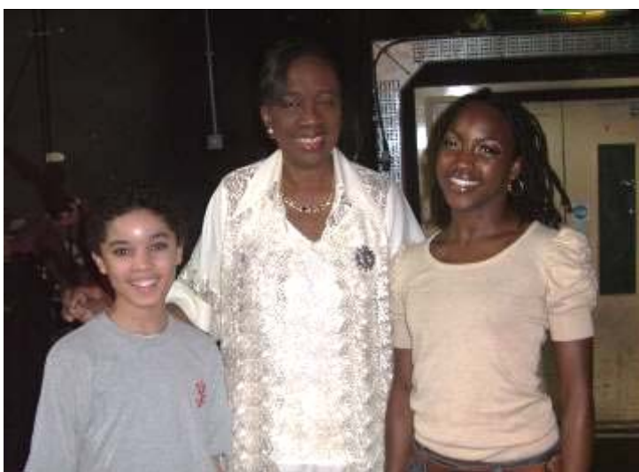
Visiting Minister of Community Development, Culture and Gender Affairs, Senator the Honourable Joan Yuille Williams (centre) with Lion King stars Jonathan Bishop and Zara Aba Bartels. The actors were paid a courtesy call backstage after the proud Hon. Minister witnessed their inspired performances. See Story on page 8.

The Prime Minister stated: "We will seek to attract to Trinidad and Tobago a second refinery of about 250,000 barrels per day capacity, which will also