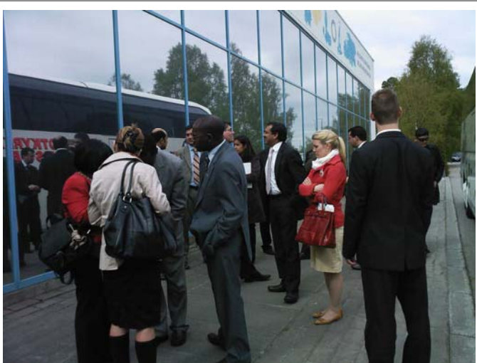
Trade Attachés at the event in Sweden.

The Academy also included a visit to Atlas Copco GDE, a division of the Atlas Copco Group, one of Sweden's leading companies in Geotechnical Drilling and Exploration.