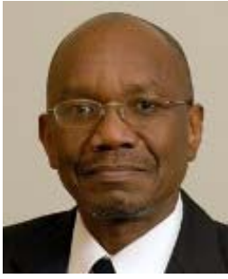
Left: Sen. the Hon. Martin Joseph Minister of National Security

A contingent of two hundred (200) personnel from the United States Army South (USARSO) is in Trinidad and Tobago to undertake various community-related and humanitarian projects in partnership with the Trinidad and Tobago Defence Force.