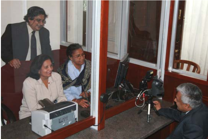
Members of staff at the High Commission, London, examine the proposed capture site for the issuance of machine readable passports here in the UK.

The Immigration Division of the Ministry of National Security has announced the introduction of its Trinidad and Tobago Passport Appointment System.