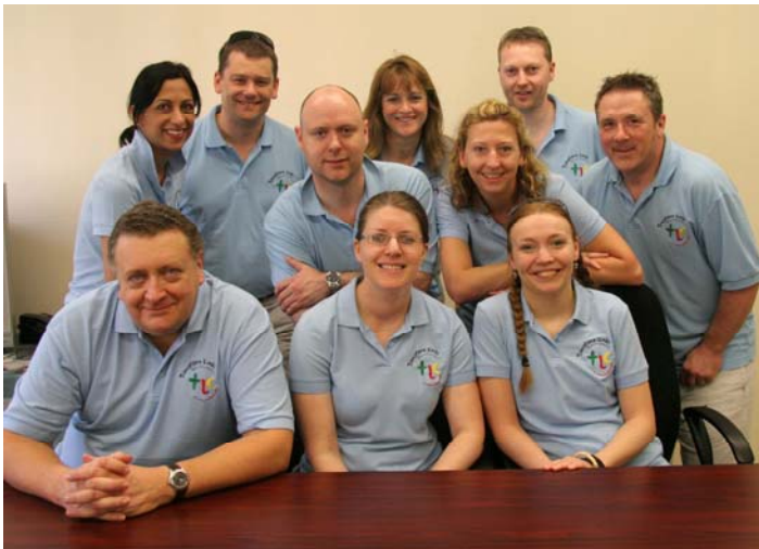
The TLC Team to Trinidad and Tobago