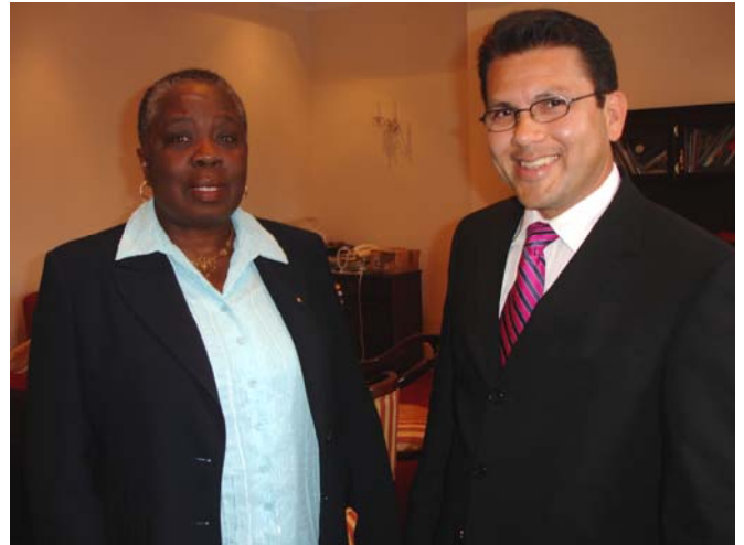
The Hon. Gary Hunt paid a visit to the Trinidad and Tobago High Commission, London, while in transit, on his way to Sri Lanka. Pictured above with Ag. High Commissioner Victoria Farley.

Minister Hunt used the opportunity to promote the upcoming Commonwealth Youth Forum (CYF) 2009, which will be held in Trinidad and Tobago in the wings of the Commonwealth Heads of Government Conference. In his presentation to CYMM, the Honourable Minister extended a warm welcome to all member states to send their delegates to what he proposed, will be the best CYF ever.