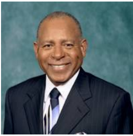
The Honourable Patrick Manning Prime Minister

The Honourable Patrick Manning, Prime Minister of the Republic of Trinidad and Tobago, in response to an invitation from the President of Mexico, His Excellency Felipe Calderon Hinojosa, led a delegation of Government officials to Cancun, Mexico, to participate in the World Economic Forum on Latin America. The forum was held on