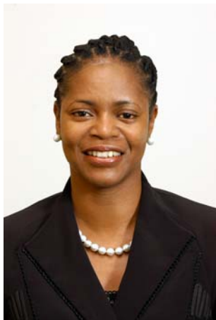
Pictured: The Honourable Alicia Hospedales Minister of State Ministry of Social Development

Senior citizens of Trinidad and Tobago will soon see four new senior activity centres established in Barataria, Laventille, Couva