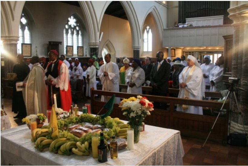
The Congregation at the All Saint Church, London